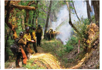
Left to right: Participants monitor the progress of their fire during a prescribed fire training exchange in Nebraska. FLN partners use fire to improve habitat for a host of plants and animals; for example, Venus flytraps from North Carolina's Green Swamp Preserve thrive after controlled burns. The Ukonom Hotshots shepherd the Butler Fire around Butler Flat, CA using an old miner's ditch. This community—in the Western Klamath Mountains landscape—participates in the Fire Adapted Communities Learning Network as well as the Fire Learning Network.